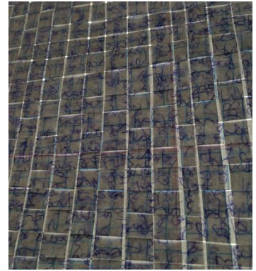
4. text-weaves Kelly Malone