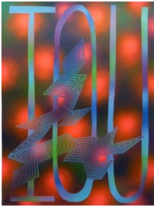
2. IOU Sara Hughes