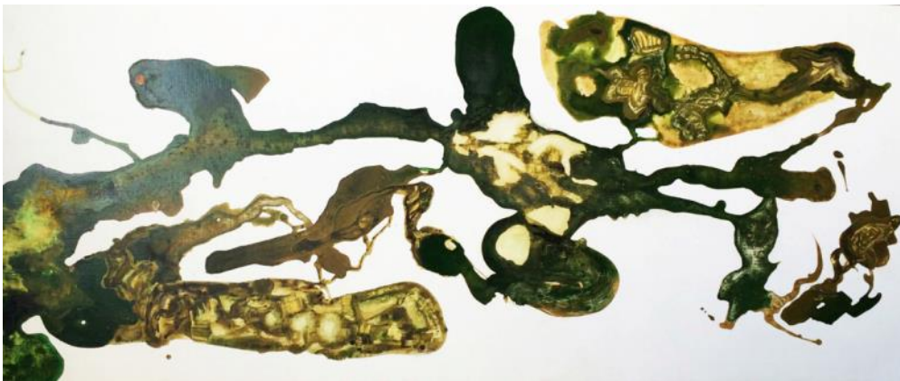
10. B IV Bernadette Malone