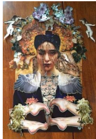
6. A Simple Method to Control Bleeding Ruby Porter