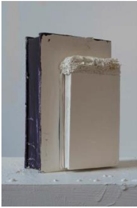
1. Requiem for a Colour Cat Fooks